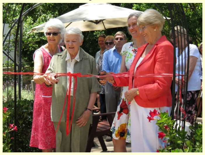
The official opening