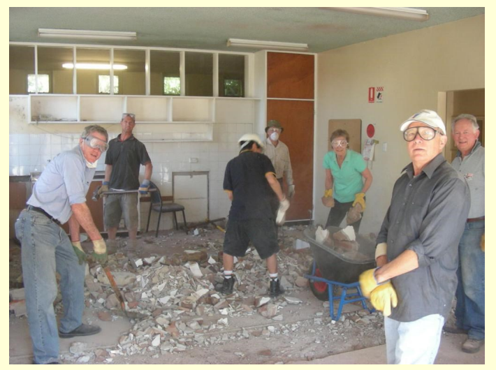
The club's demolition squad in action

Funding came from 'Friends of Neringah' (about $25,000), our club (about $5,500 plus significant labour) and Hammond Health Care.