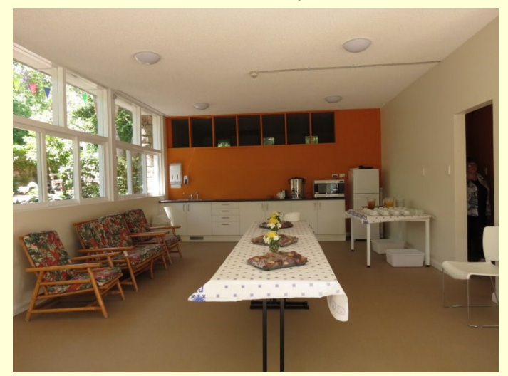
The completed room for patients and their visitors