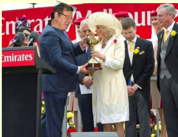
Dreams are made of this