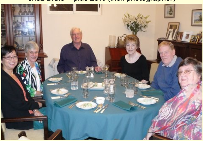
chez Hungerford – minus 12.5% (incl. photographer)