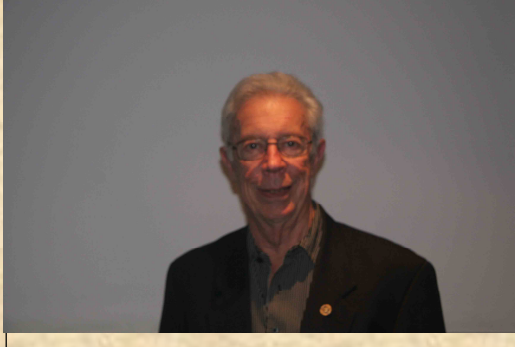
Rotary Awareness Night