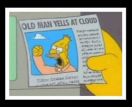
What young people think I do