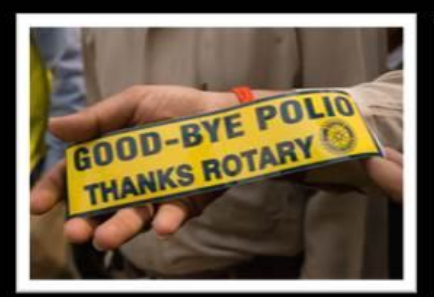
What my family thinks I do