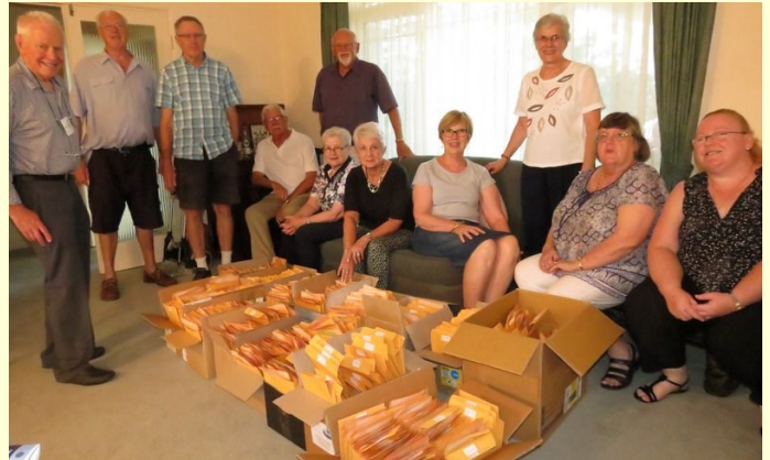
Envelope stuffers and stuffed envelopes