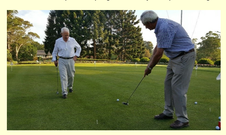
Watch out for jaywalkers, Ross!