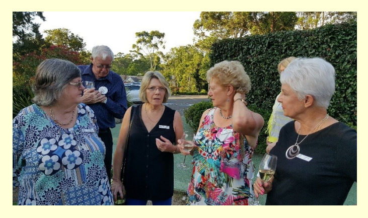
The WAGs (and a minder) doing what WAGs do.