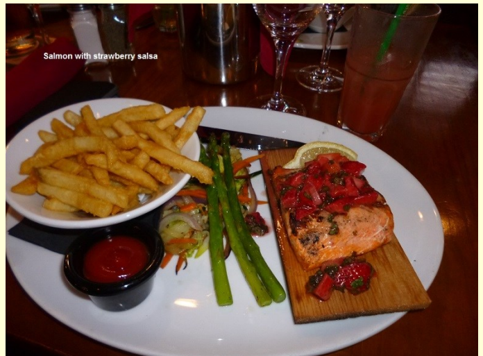
Salmon with strawberry salsa

Did you see Malcolm's dinner on FaceBook? (Salmon with strawberry salsa.)