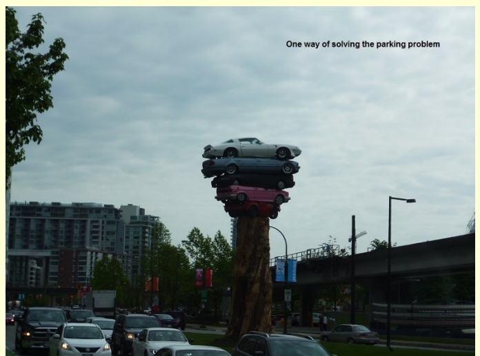
One way of solving the parking problem